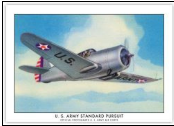
Typical Card Front

American Card Catalog No.: ..... T87-1 Title:..... Modern American Airplanes Manufacturer:..... Brown & Williamson Tobacco Corp. Card Dimensions:..... 2-1/2" x 1-1/4" Number of Cards:..... 50 Numbering: ..... 1-50 Graphics: ..... photos provided by Popular Aviation Circa:..... 1940