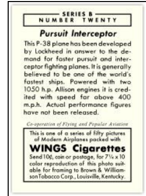
Typical Card Back

American Card Catalog No.: ..... T87-3 Title:..... Modern American Airplanes Manufacturer:.....Brown & Williamson Tobacco Corp. Card Dimensions:.....2-1/2" x 1-1/4" Number of Cards:.....50 Numbering:.....1-50 Graphics:.....photos provided by Popular Aviation Circa:.....1940