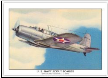
Typical Card Front

American Card Catalog No.: ..... T87-2 Title:..... Modern American Airplanes Manufacturer:..... Brown & Williamson Tobacco Corp. Card Dimensions:..... 2-1/2" x 1-1/4" Number of Cards:..... 50 Numbering: ..... 1-50 Graphics: ..... photos provided by Popular Aviation Circa:..... 1940