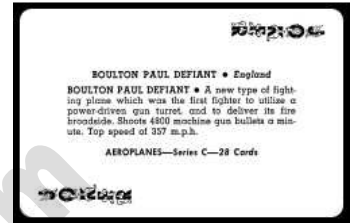
“Joker” Back Card

American Card Catalog No.:.....R112-4 Title:.....Aeroplanes Series ‘C’ Manufacturer:.....Leaf Gum Co., Chicago, IL Card Dimensions:.....2-1/4” x 3-1/8” Corners:.....playing card (rounded) Number of Cards:.....28 Number with Variations:.....57? Numbering:.....unnumbered Graphics:.....artwork drawings Circa:.....1940-41