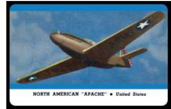
Typical Card Front