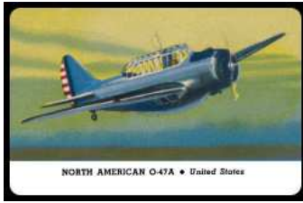
Typical Card Front