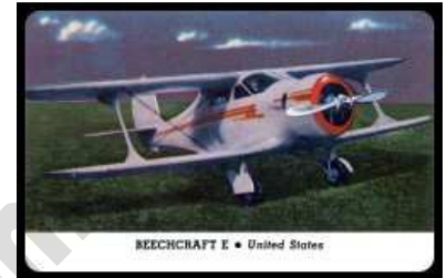
3 – Civil Aircraft

See Series ‘A’ for Miscellaneous Navy cards from the ‘Mixed’ Series.