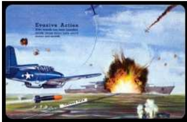
2 – Aircraft Strategies

The “Military Aircraft” and “Aircraft Strategies” cards together make up a print run of 27 cards.