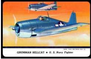
1 - Military Aircraft Front

American Card Catalog No.:.....R112-12 Title:.....‘Mixed’ Series Manufacturer:..... Leaf Gum Co., Chicago, IL Card Dimensions:..... 2-1/4" x 3-1/8" Corners:.....playing card (rounded) Number of Cards:.....45 Numbering:.....unnumbered Graphics:.....paintings Circa:.....1944